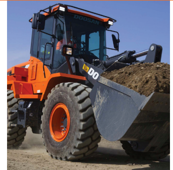
//ABOVE & LEFT R&H EXCAVATING LLC RELIES ON DOOSAN EXCAVATORS AND WHEEL LOADERS TO CLEAR AND MOVE LARGE SWATHS OF LAND.

As a result, R&H Excavating LLC has been working with Best Line Equipment for about five years, relying on them as a trusted Doosan dealer. They have purchased three DX300s, two DX255s, a DX140, and a DL280-5. With the help of this equipment, R&H Excavating LLC has continued to provide excellent, dependable services to their customers.